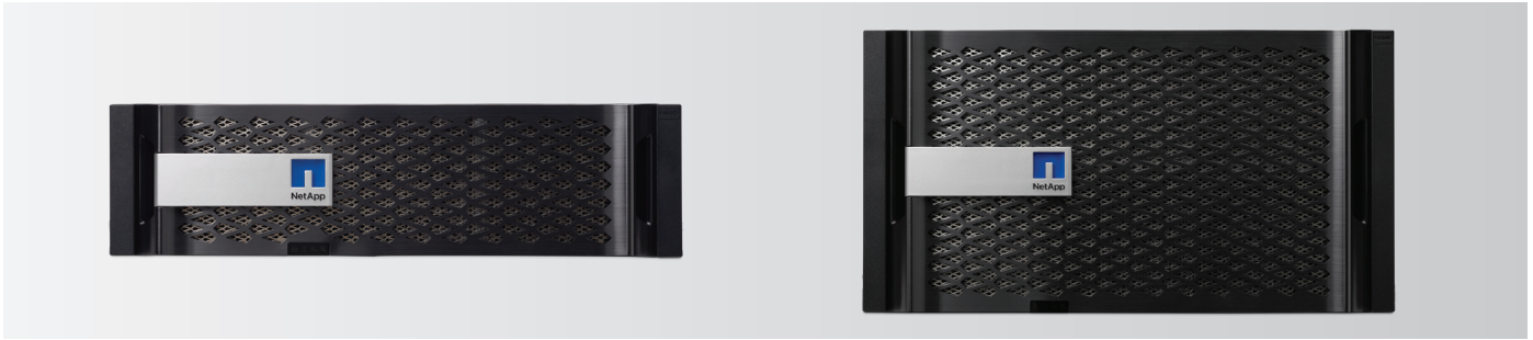
Figure 1) NetApp FAS8000 controllers.

For performance-intensive environments where maximum scale and I/O throughput are necessary to drive business-critical applications, NetApp offers the FAS8080 EX. You can find out more in the FAS8080 EX datasheet.